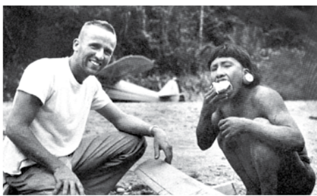
Image: Nate Saint with Waorani village member.