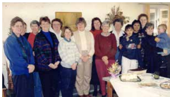
Image at top: Archive photo of a church sharing about and supporting MAF. Image above: Women's prayer group and Bible study in Ballarat, Aus in the 90s.

The MAF movement in Australia traces its roots back to the Melbourne Bible Institute (now Melbourne School of Theology), where a group of former RAAF aircrew, then students at the college, began laying plans for an aviation mission. The MBI faculty stood firmly behind this small but determined group, nurturing their vision to reach isolated communities with aviation and the Gospel (see page 6).