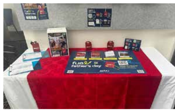
Image: St Mary's Anglican Church in Sunbury, VIC running a Fuel for Father's Day event.