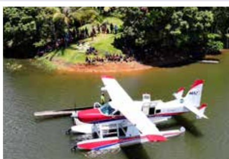
Image: MAF's amphibious plane landing at Lake Murray, PNG.