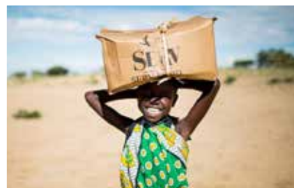
Serving Orphans in Kenya.

"We run a food program in Turkana county and have been actively distributing food for the past 15 years. During this time, we have experienced multiple famines in the region and have been able to respond with teams to support. This was made possible through flights chartered through MAF."