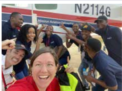
Image: MAF Guinea team celebrating first year of operation in April 2023.

In 2010, the Christian Radio Missionary Fellowship became MAF Technologies, strengthening HF radio communication across PNG. The network, linking over 900 remote locations, facilitates life-saving medevac flights, receiving more than 4,000 calls annually. Additionally, MAF Technologies provide communities with internet access, enabling pastors and teachers to access vital ministry resources.