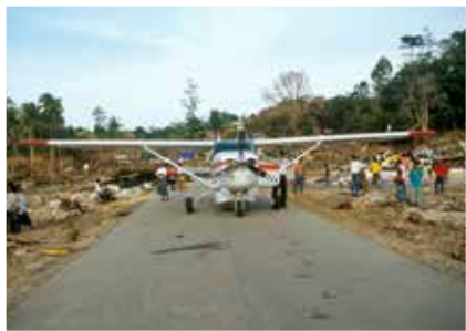
Image: Cessna 206 on road bringing boxes of essential relief supplies to the village of Alue Titi following the Boxing Day tsunami.